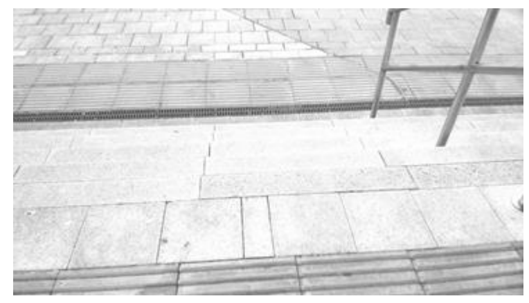
Photo taken in black and white demonstrates little contrast giving the illusion of a 'slope' to a visually impaired person.

Steps & stairs require slip-resistant edge marking in a contrasting colour. Marking should extend the full width of the step, be 55mm wide on the edge of the tread & top of the riser and comply with all relevant standards/guidance e.g. Equalities Act, Approved Documents and British Standards. A permanent solution e.g. self-coloured slip-resistant GRP is preferable to paint as it is more durable and reduces the need for on-going maintenance.